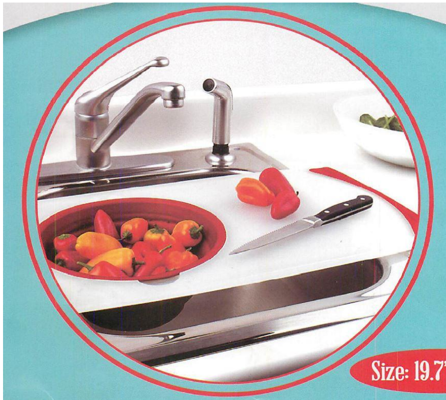
Defendant's Infringing Label Insert (trimmed for emphasis)