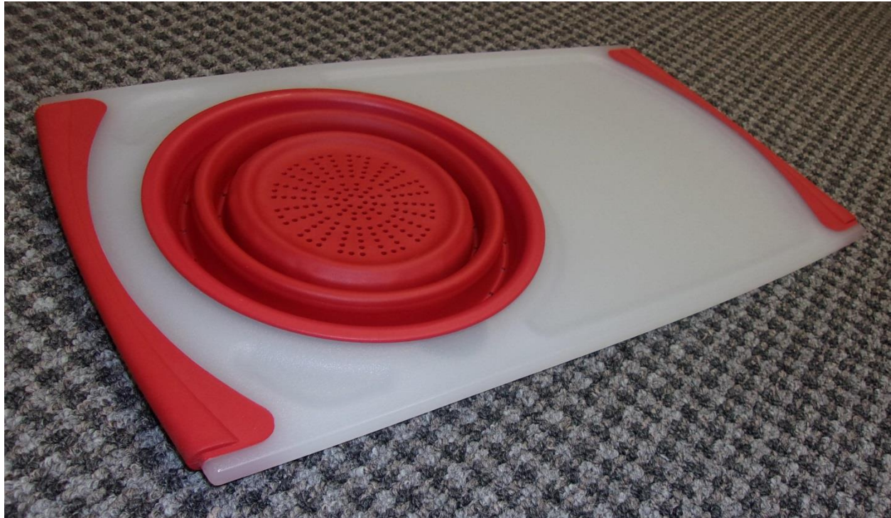
Defendant's Infringing Product

importing, and/or using a product embodying the Plaintiff's patented invention.