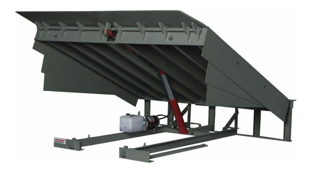
(ECF No. 264, ¶ 8 (depicting Systems's infringing dock leveler).)

Nonetheless, in light of the Supreme Court's conclusions in Samsung , even accepting these facts as true does not necessarily mean that the entire dock leveler is the article of manufacture. Much more important in light of Samsung is the fact that the patented design element relates to only a portion of the overall product. Depicted here is a complete dock leveler. The lip and hinge plate constitutes only the uppermost segment.